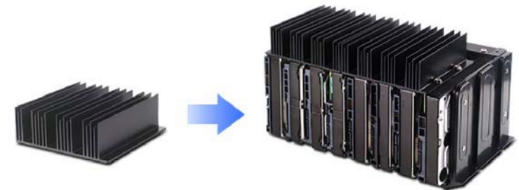
Built-in innovative hard drive cooler