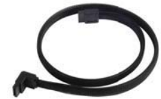
CP08 SATA-II cable with 90 degree connector.