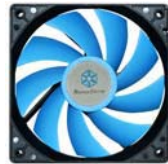
Suscool 121 120mm fan with super quiet temperature control.