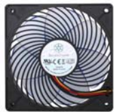
AP121 Wide fan blades for reducing air resistance.