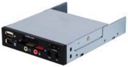
FP35 3.5" device bay with eSATA, card reader, USB, 1394, and audio.