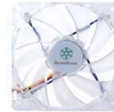
FN121-BL Equip your TJ04-E with FN121-BL for added lighting effect in available 120mm fan slots.